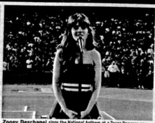
Zooley Deschanel sings the National Anthem at a Texas Rangers game.

'DON'T GIVE UP THE SHIP!' uttered by a dying captain when the USS Chesapeake was disabled, is still a popular naval battle cry.